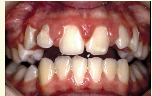
Damage caused by the brace due to sugary snacks/drinks and poor brushing

Sugary snacks/drinks and poor cleaning of your teeth and brace will lead to permanent damage to your teeth as shown in the picture below.