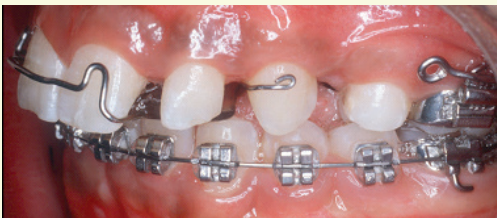
A removable brace on the top teeth and a fixed brace on the bottom teeth

To begin with you may produce more saliva and have to swallow more than normal. This is quite normal and will quickly pass.